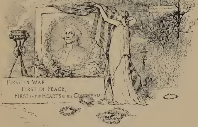
FROM THE MONUMENT

U.S. DELAWARE PENNSYLVANIA NEW JERSEY GEORGIA CONNECTICUT MASSACHUSETTS VERMONT SOUTH CAROLINA NEW HAMPSHIRE VIRGINIA NEW YORK NORTH CAROLINA RHODE ISLAND KENTUCKY VERMONT TENNESSEE OHIO LOUISIANA INDIANA MISSISSIPPI ILLINOIS ALABAMA MAINE MISSOURI ARKANSAS MICHIGAN FLORIDA IOWA TEXAS WISCONSIN CALIFORNIA MINNESOTA OREGON KANSAS WEST VIRGINIA NEVADA NEBRASKA COLORADO DIST OF COLUMBIA UTAH NEW MEXICO WASHINGTON DAKOTA ARIZONA IDAHO MONTANA WYOMING ALASKA INDIAN